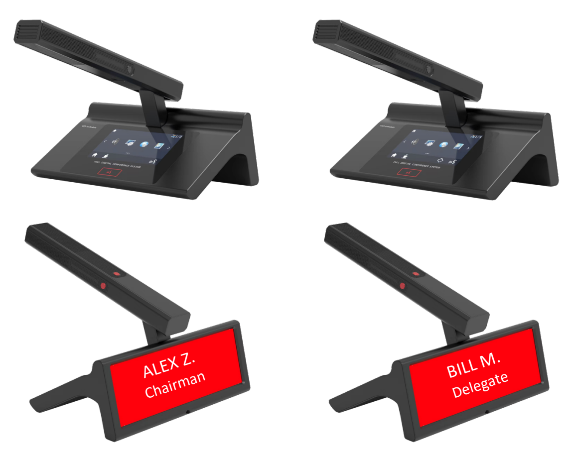
iMeeting X-Mic-VNC (Chairman Unit)