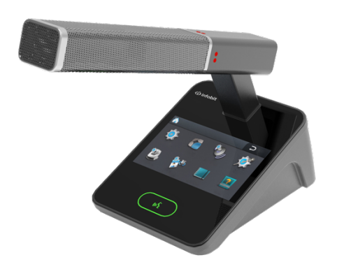
iMeeting X-Mic-VD (Delegate Unit)