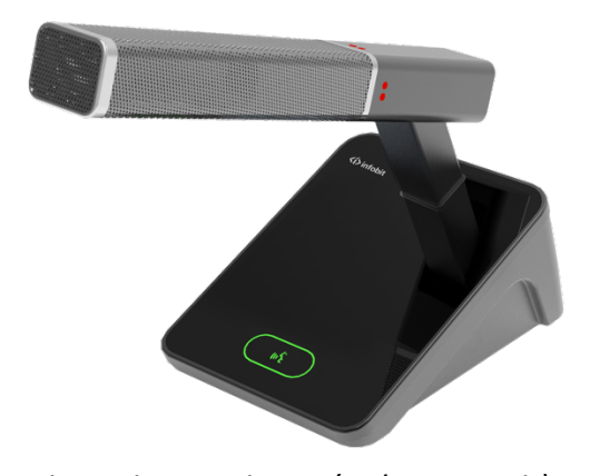
iMeeting X-Mic-DD (Delegate Unit)