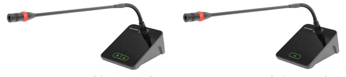
iMeeting X-Mic-RC (Chairman Unit) iMeeting X-Mic-RD (Delegate Unit)

Gooseneck Round stem: Pure Discussion, without screen