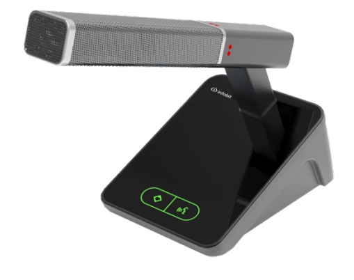
iMeeting X-Mic-DC (Chairman Unit)