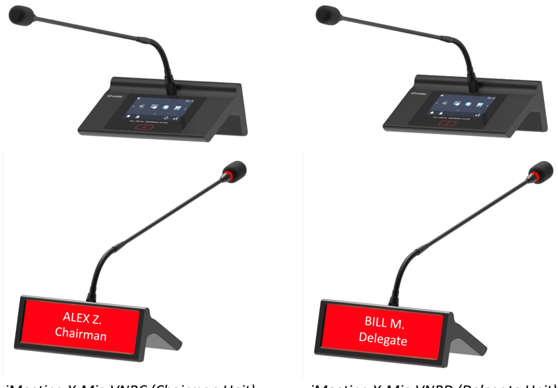
iMeeting X-Mic-VNRC (Chairman Unit)

Gooseneck Round Stem: With Voting and Nameplate