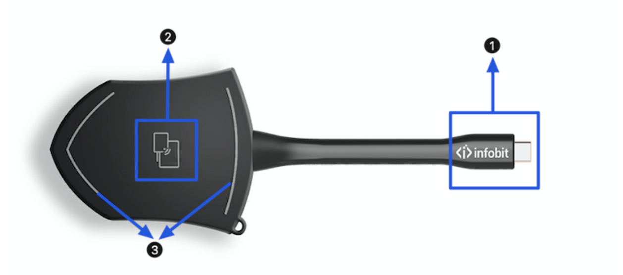
Model: iShare CX

Note: iShare CX is full function type-C interface with DP Alt mode inside, which supports Audio and video transmission. Thus PC's type C connector also requires full function for mirroring screen.